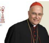
FRANCIS CARDINAL GEORGE, O.M.I. ARCHBISHOP OF CHICAGO